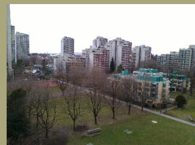
Suburbs of Switzerland in 2018