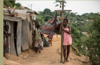
Suburbs of Cabinda in 2018

Russia, China & the Bandung Nations: Africa's survival today....18