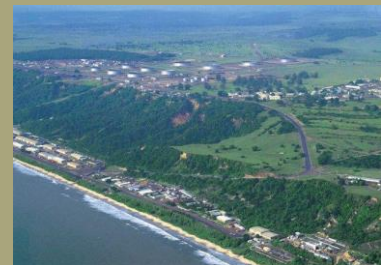
Malongo: Cabinda's Oil-Rich Field