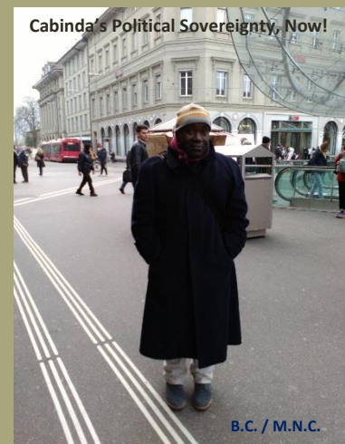
Cabinda's Political Sovereignty, Now!