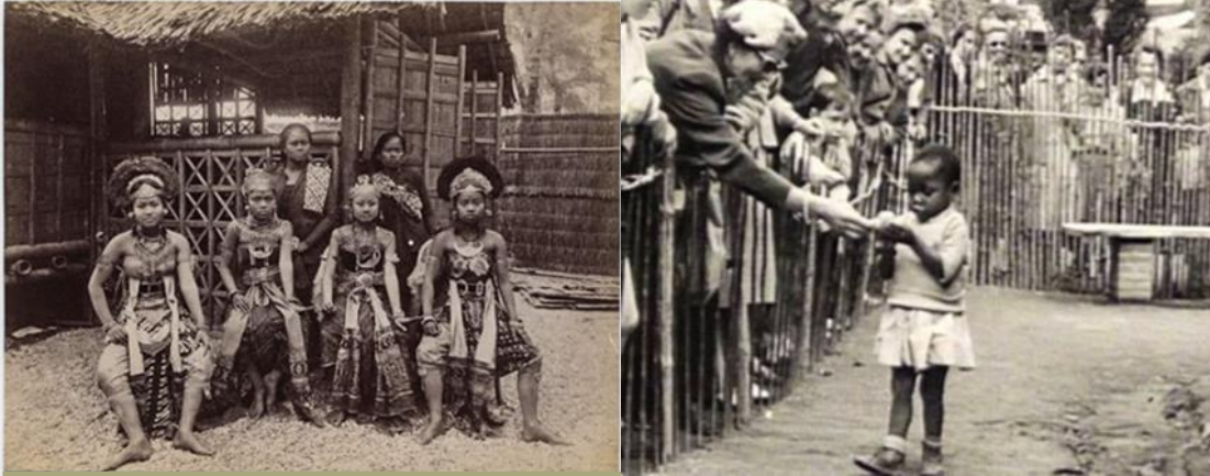
Top left: Exhibit in a human zoo of African and Asian Girls at the Parisian World Fair in 1931 drew 34 million spectators from everywhere in the Western imperialist world. Top right: A little black baby in a human zoo (Belgium, ca. 1958), with White “civilized” spectators feeding her bananas as if she were a little monkey.